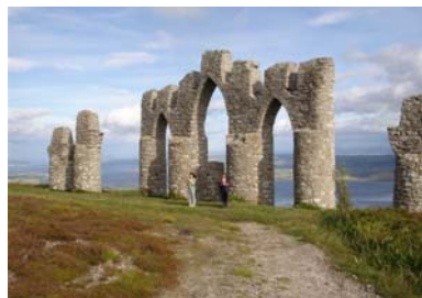
The Fyrish Monument