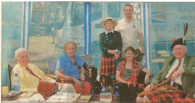
Just to show that the Munros & Camerons are no longer enemies, here are the Camerons looking very relaxed at the Gathering